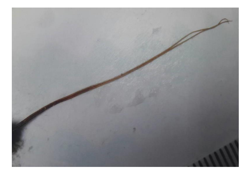
Figure 2. A male proboscis of the crespuscular hawk moth ( 46.03 \pm 2.33 mm long)