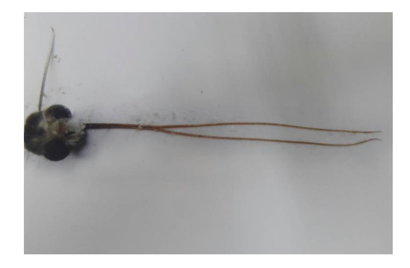
Figure 3. A proboscis length of adult female N. hespera ( 44.03 \pm 2.08 mm long)