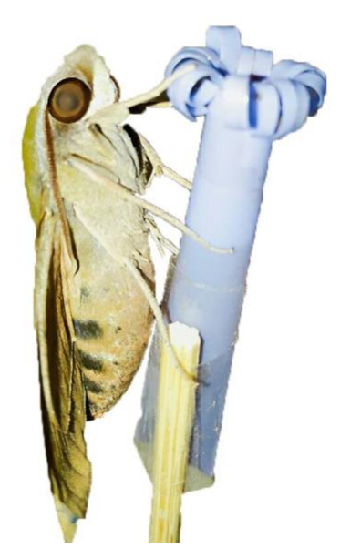
Figure 4. The hawk moth using its proboscis for honey solution uptake