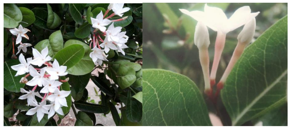
Figure 1. Flowers of the karanda