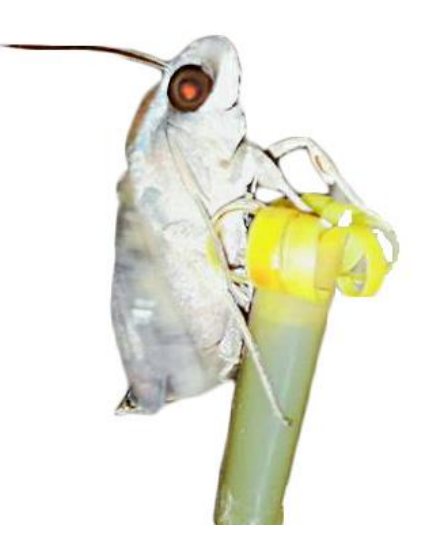
Figure 5. Landing position of crepuscular hawk moths